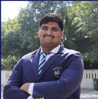
Meet Rada Director General & DISEC Chair